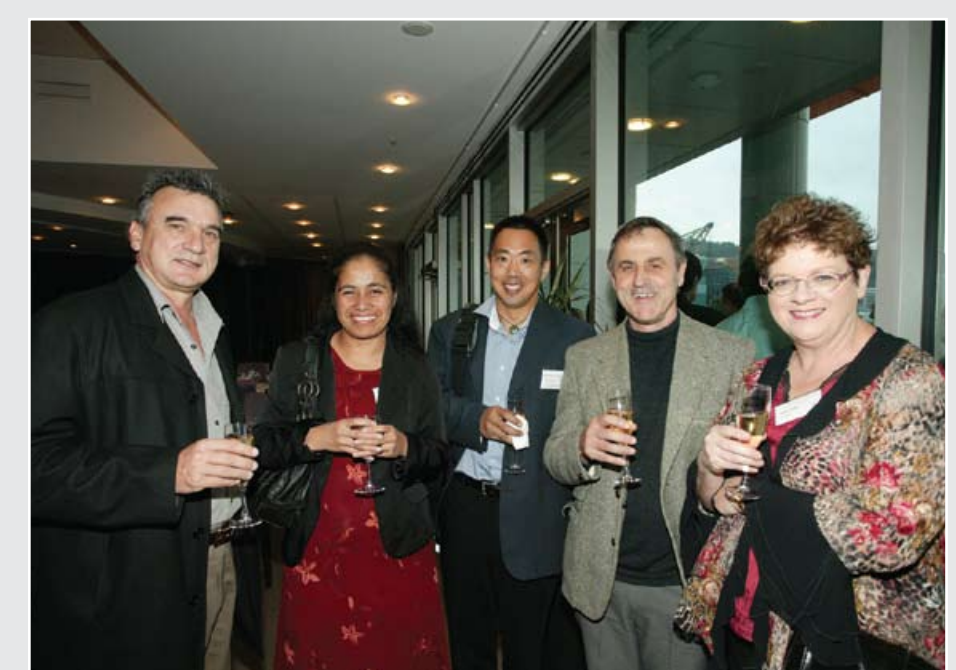
Branch delegates at the dinner