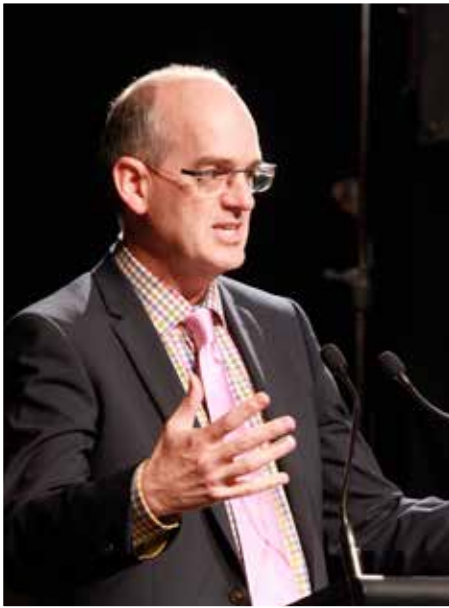
Hon Tony Ryall, Minister of Health