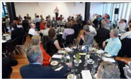
Dinner at Te Wharewaka