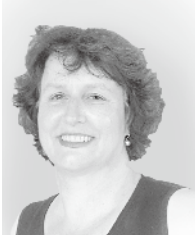
Assistant Executive Director