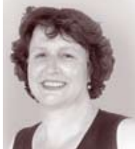
Assistant Executive Director