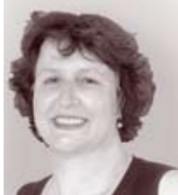
Assistant Executive Director